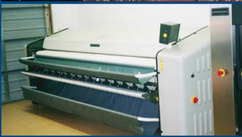
Goulding's Lodge is a 68-room resort located in the midst of the Navajo reservation in Monument Valley. Its new on-premise laundry is expected to save the hotel around $40,000 per year.